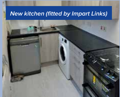
New kitchen (fitted by Impart Links)

We are now also bidding for government funding to help pay for work to improve insulation in our properties, to make them warmer and more energy efficient.